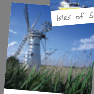
Thurne Dyke Mill, Norfolk